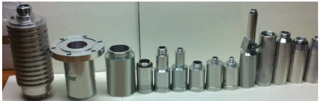
SENSORS ARE AVAILABLE FOR ANY TYPE OF BUSHING THROUGH 765 KV