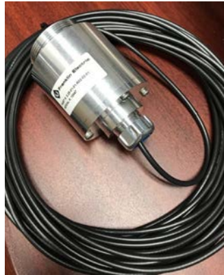
EXAMPLE BUSHING SENSOR