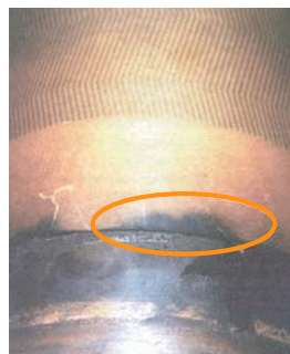
GE Type U Bushing with burned paper layers and evidence of partial discharge at foil edge