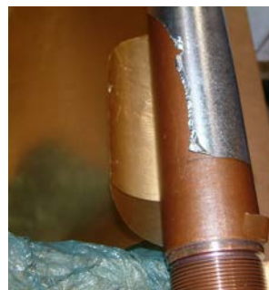
Bushing with burned paper layers and evidence of partial discharge at foil edge

ON-LINE MONITORING OF POWER FACTOR PREVENTED THESE BUSHINGS FROM FAILING IN-SERVICE.