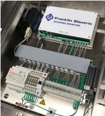
FRANKLIN GRID SOLUTIONS BUSHING MONITORING SYSTEM