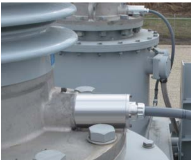
EASY AND SAFE BUSHING SENSORS